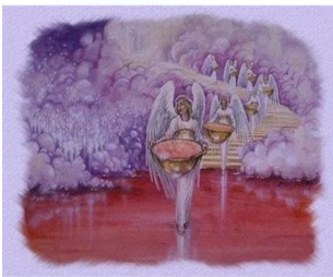
© 2020 Grace For The Last Days Ministry

Then I saw another sign in heaven, great and marvelous: seven angels having the seven last plagues, for in them the wrath of God is complete.