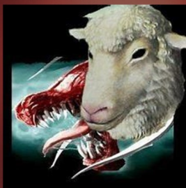
© 2020 Grace For The Last Days Ministry

Matt. 24:4; 24:24; 2Thess. 2:9; 1Cor. 13