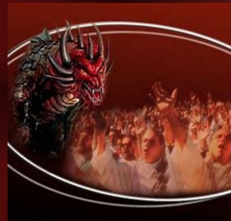
© 2020 Grace For The Last Days Ministry

So they worshiped the dragon who gave authority to the beast; and they worshiped the beast, saying, “Who is like the beast? Who is able to make war with him?”